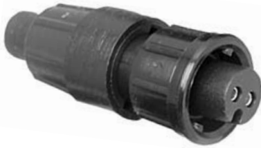
Cable Socket 1628X-XSG-XXX Matching Mates: • Cable-Cable 1828X-XPG-XXX • Panel 172XX-XPG-XXX